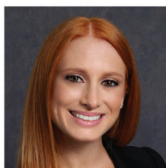
AMY ROKUSON FAMILY LAW